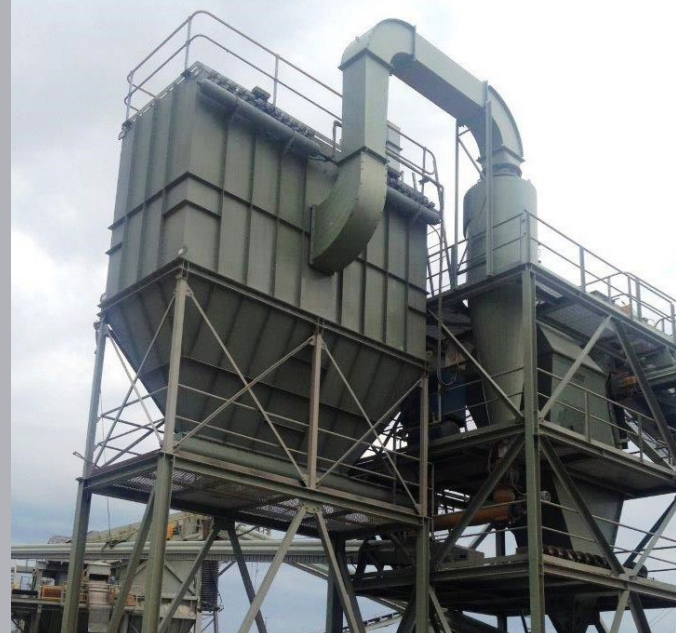
Air classifier – QLD quarry